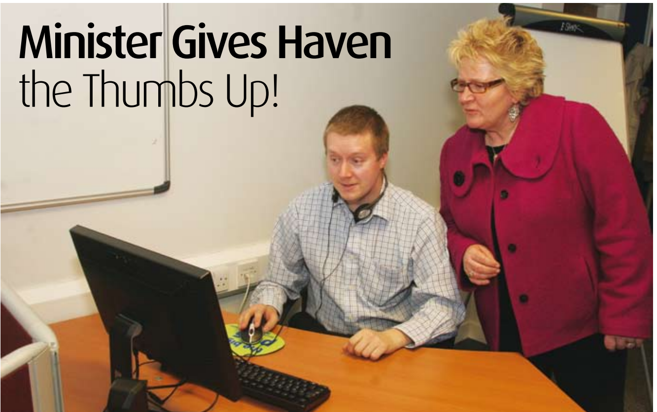
Pictured above: Anne McGuire MP, UK Minister for Disabled People, examining the facilities at Haven Products' new learning centre in Hillington, Glasgow.