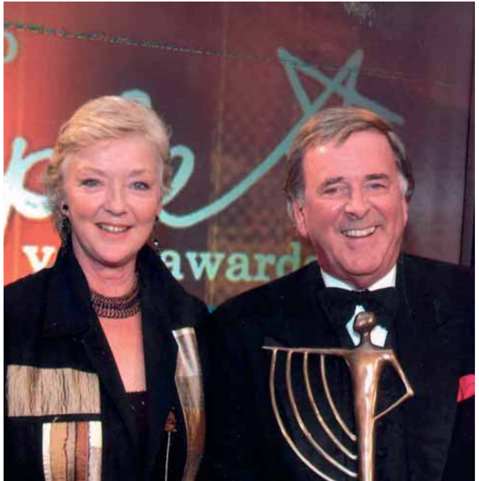
RTE radio presenter and People of the Year award recipient, Marian Finucane pictured with Terry Wogan, who was named Ireland's Greatest Living Entertainer.