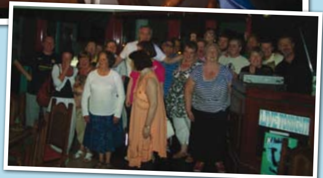
People who attend RehabCare in Limerick enjoying their holiday at the Bungalows Nautilus Resort in Lanzarote.

been going abroad for 11 years now with those who attend our RehabCare resource centre and this is the first hotel complex we have come across that is very, very disabled friendly.” The resort comprises 70 bungalows, over 30 of which are wheelchair accessible, as well as the reception and restaurant areas. What sets it apart from other resorts of its kind is the thought that has been put into the resort’s development. “The hotel manager explained that they brought architects in to specifically look at things that would make the complex accessible for a range of disabilities. They are also lobbying the local councils to make the area surrounding the hotel accessible also. On the whole it was good.”