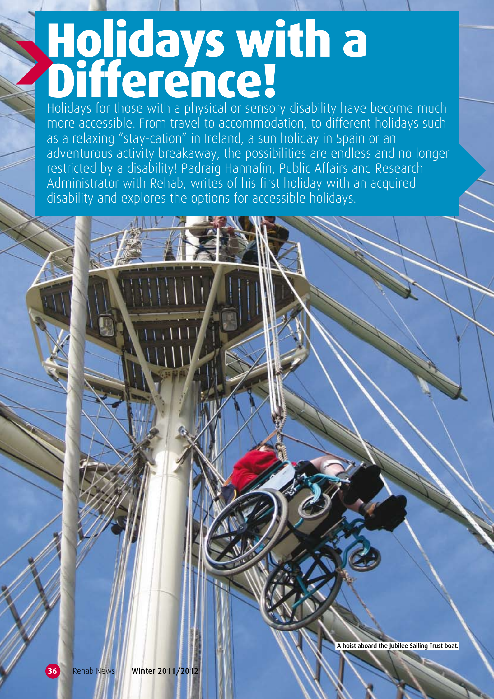
A hoist aboard the Jubilee Sailing Trust boat.