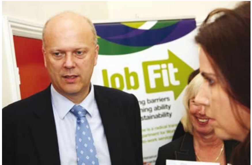
Chris Grayling, Minister of State at the Department for Work and Pensions, on a recent visit to the Salvation Army Employment Plus premises in Bristol, one of Rehab Jobfit's subcontractors for delivery of the Work Programme.

Chris Grayling, Minister for Employment at the Department for Work and Pensions, recently visited Rehab Jobfit's delivery of the Work Programme at the Salvation Army Employment Plus premises in Bristol where he met unemployed participants and the staff working to help them to get sustainable employment.