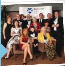
Pictured: Bighearted Scotland Award winners with (back row, far left) Deputy First Minister Nicola Sturgeon MSP and (back row, third from left) TV presenters Kaye Adams and (back row, third from right) Stephen Jardine.